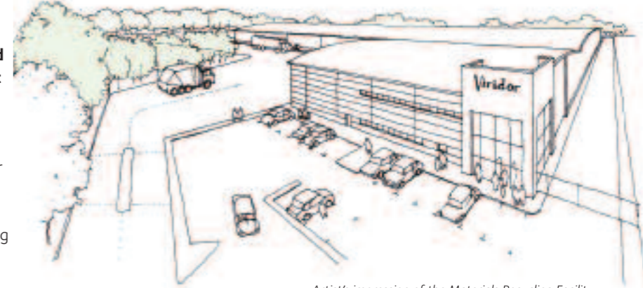
Artist's impression of the Materials Recycling Facility

Once the MRF is fully operational, local authorities will be in a position to assess their kerbside recycling services with a view to